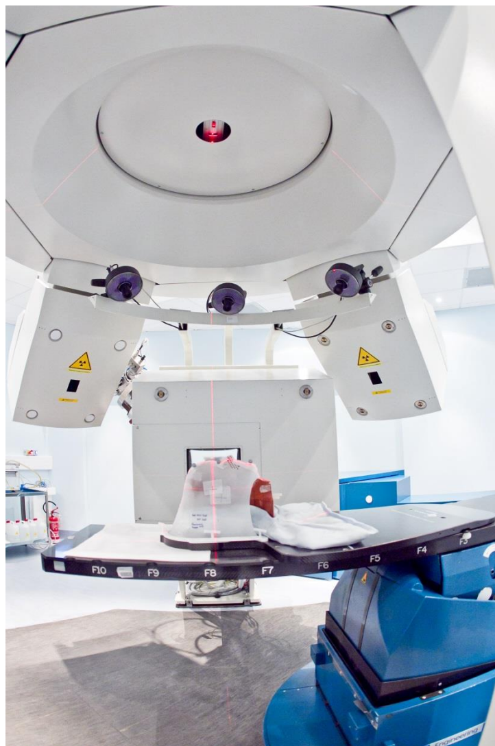
Figure 2: One of the three CNAO treatment rooms.

The second project activated at CNAO will be Tumor tracking in particle therapy . The selected candidate will be involved in the design, implementation, experimental assessment and clinical transfer of an integrated system and related strategies for tumour tracking in active beam scanning particle therapy at the CNAO premise ( www.fondazionechnao.it ). Activities envisage the refinement of the interfacing between the CNAO Optical Tracking System (OTS) already available for patient set-up verification and applied for external-internal correlation modelling, and the CNAO Dose Delivery System (DDS) developed by CNAO and the National Institute of Nuclear Physics (INFN). Figure 2 represents a detail of one of the CNAO treatment rooms.