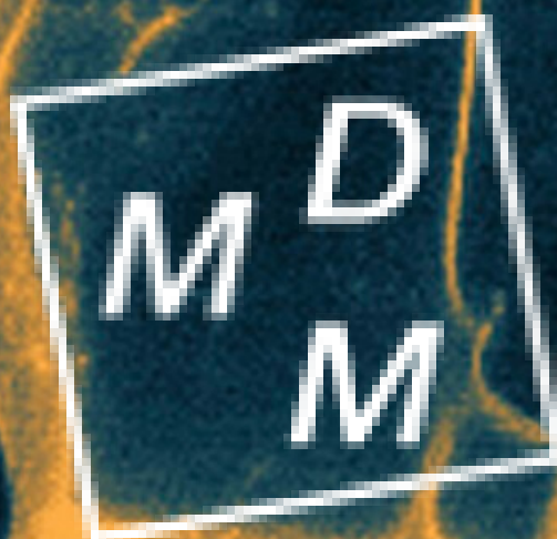
Human stem cell embedded in a 3D matrix, Cryo SEM

Department of Molecular Medicine University of Pavia